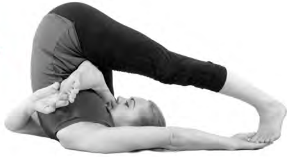
"Supta Urdhva Pada Vajrasana" (preparation)