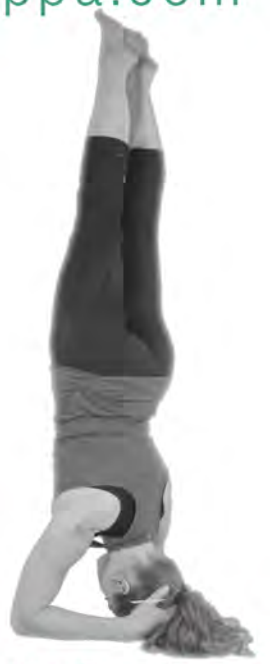
"Viparita Dandasana" (preparations & exits)