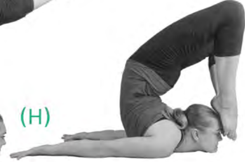
"Ganda Bherundasana A and B"