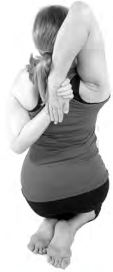
"Gomukhasana A and B"