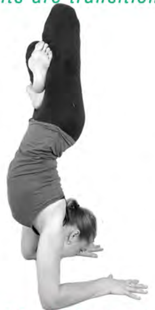
"Karandavasana" (preparation & exit)